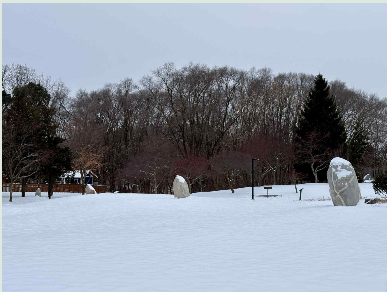
Photo: Standing stones at Muriel Sahlin Arboretum at Roseville Central Park, Roseville, Minnesota.