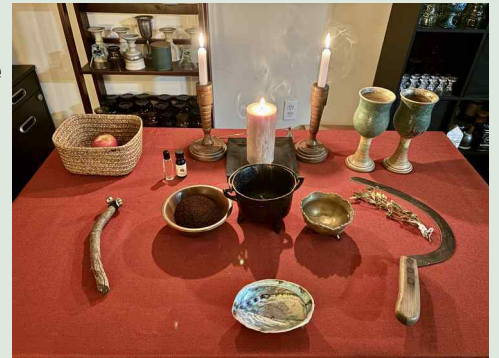
A Keltrian Altar Setup

We then examined the liturgical styles of Ár nDraíocht Féin, the Henge of Keltria, the Order of Bards, Ovates, and Druids, and lastly the Ancient Order of Druids in America. The Henge of Keltria took the most time to discuss, due to the elaborate nature of their ceremonies, and the specific details they are required to touch on. It also happened to be an organization of interest with one of our Grove members, and we have a wealth of knowledge on how a Keltrian ritual is run.