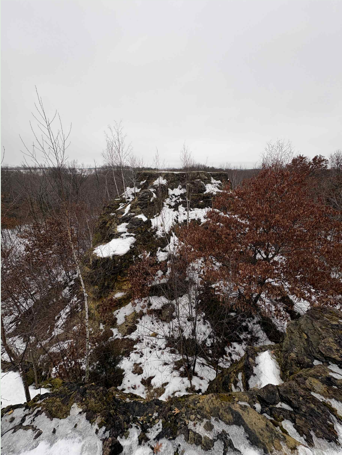
Atop Lone Rock, a sandstone spire in Vermillion Highlands WMA, Rosemount, MN

A very special thank you photograph dedicated to everyone who contributed to this article!